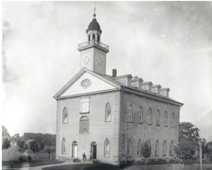
Members of the Church built the Kirtland Temple between 1833 and 1836 amid great poverty and persecution.

That winter was a busy time for the young church. The Kirtland Temple was nearing completion after being under construction for three years. Poverty and persecution had plagued the Saints there, and at one point Elder Heber C. Kimball recorded that he and other workmen had slept in their clothes at the site, "and were obliged to lay with our fire locks in our arms." 3