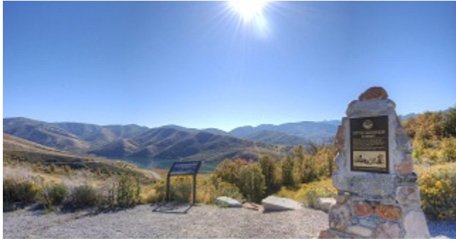
The summit of Little Mountain, which leads down into Emigration Canyon.