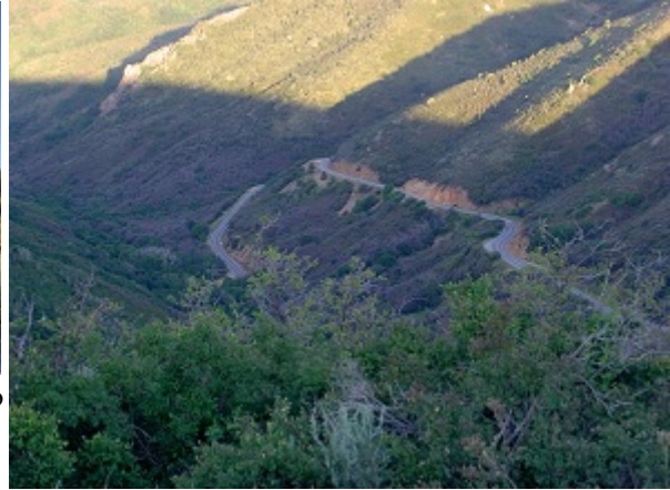
Modern hikers enjoy the trails down Big Mountain.

As they reached the mountains near Salt Lake, two days of travel still lay ahead of them. After taking one day to descend Big Mountain, the companies would camp for the night. The next day they would descend Little Mountain through Emigration Canyon and into the valley below.