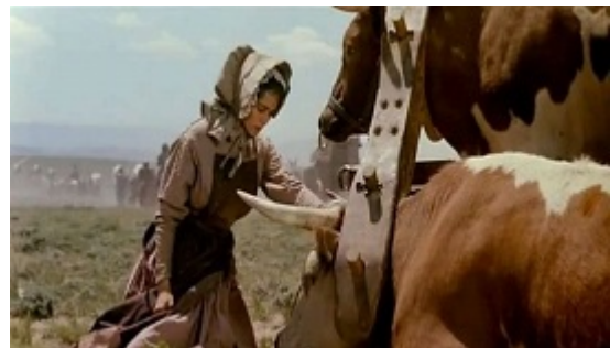
This modern portrayal is of Mary Fielding Smith praying over her ill oxen.