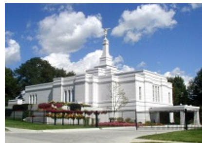
President Hinckley dedicated this beautiful temple in 2001 at the site of the Winter Quarters encampment.

After the pioneers were firmly established in Utah, they sent wagons back to the Elk Horn outfitting