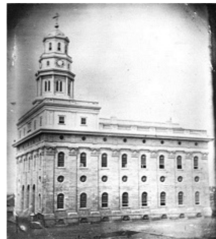
Although not yet completed, the Nauvoo Temple was dedicated in October, 1845.

Through the indefatigable exertions, unceasing industry, and heaven-blessed labors, in the midst of trials, tribulations, poverty, and worldly obstacles, solemnized in some instances by death, about five thousand saints had the inexpressible joy and great gratification to meet for the first time in the House of the Lord in the City of Joseph. From mites and tithing millions had risen up to the glory of God, as a Temple, where the children of the last kingdom could come together and praise the Lord. 28