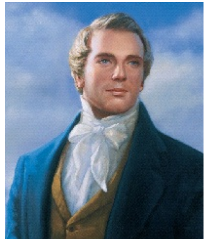
Thirty-five-year-old Joseph Smith wrote the British apostles and saints from Nauvoo.

Be assured my beloved brethren, that I am no disinterested observer of the things which are transpiring on the face of the whole earth and amidst the general movements which are in progress, none is of more importance than the glorious work in which you are now engaged, consequently, I feel some anxiety on your account, that you may, by your virtue, faith, diligence, and charity, commend yourselves to one another, to the Church of Christ, and to your Father which is in heaven, by whose grace you have been called to so holy a calling, and be enabled to perform the great and responsible duties which rest upon you. And I can assure you, that from the information I have received, I feel satisfied, that you have not been remiss, in your duty, but that your diligence and faithfulness have been such, as must secure you the Smiles of that God, whose servants you are, and the good will of the saints throughout the world.