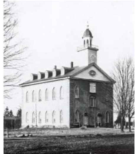
Martin Harris cared for the Kirtland Temple as long as he remained in the city.

In 1840, Kirtland was still considered to be a place for loyal Saints. Many former apostates left Missouri and other locations and located, not to Nauvoo, where life was difficult building a new city, but to Kirtland.