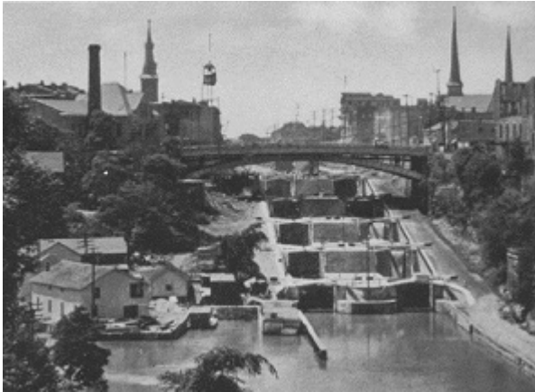
This late 19 th century photograph Lockport shows the five locks William Clayton mentioned in his journal.

I must confess I was delighted to see the superior neatness and tasty state of the buildings. Many painted white, others brick and some have the doors painted yellow. We bought some large red apples for a cent each which was truly delicious. The streets are wide but not so well flagged and paved as they are in England.