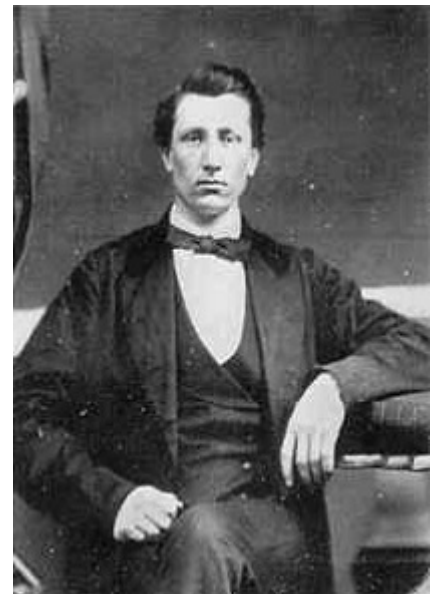
Joseph Fielding Smith was born while his father Hyrum was in jail in Missouri.

I believe both you and I shall have many more [trials] to encounter but blessed be God, he has promised that his grace shall be sufficient for us and we have hitherto found it, so oh,