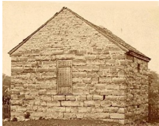
Joseph and Hyrum Smith and other men spent 4 months in Liberty Jail in 1838-1839.

In Far West, after the difficulties of the Battle of Crooked River, Hyrum and Joseph Smith, along with Sidney Rigdon and many others, were arrested. Unable to secure a trial, they were forced to wait five months for a circuit judge. As a result they were imprisoned in Liberty Jail in Independence, Missouri.